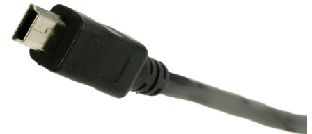
Some probes are available with the USB Mini B OTG Plug which mates with Mini USB Connector on the Basic Sensor Pack and Advanced Sensor Packs