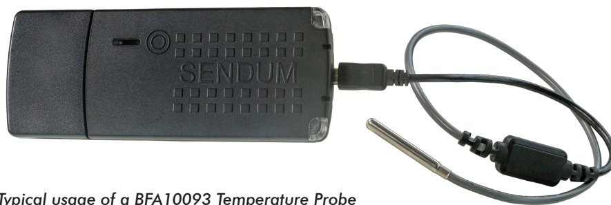
Typical usage of a BFA10093 Temperature Probe with the PT300D