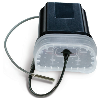
Typical usage of a Model BFA10094 Temperature Probe - connected to an Accessory Pack that is housed inside Sendum's ruggedized enclosure (that also contains a PT300D and the 10,000 mAh Extended Life Battery).