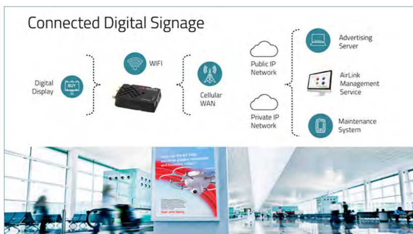
Application Example - Digital Signage