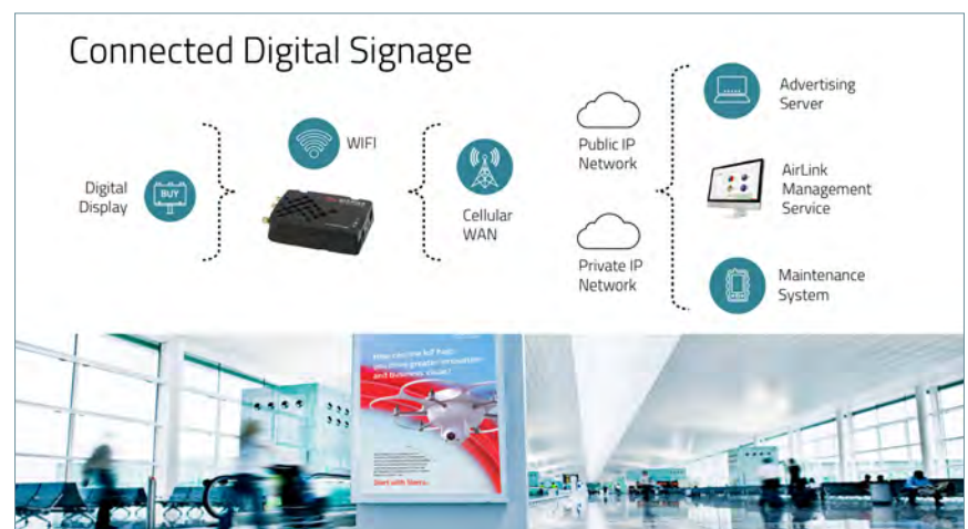
Application Example - Digital Signage