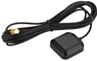
GPS Active Patch Antenna ANT-0038