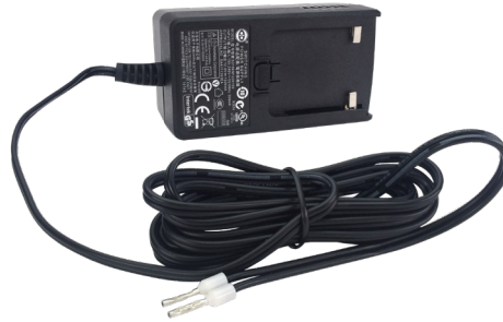
12V DC Power Supply PSU-0060