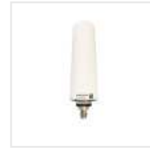
External Fixed- Mount Antenna Kit